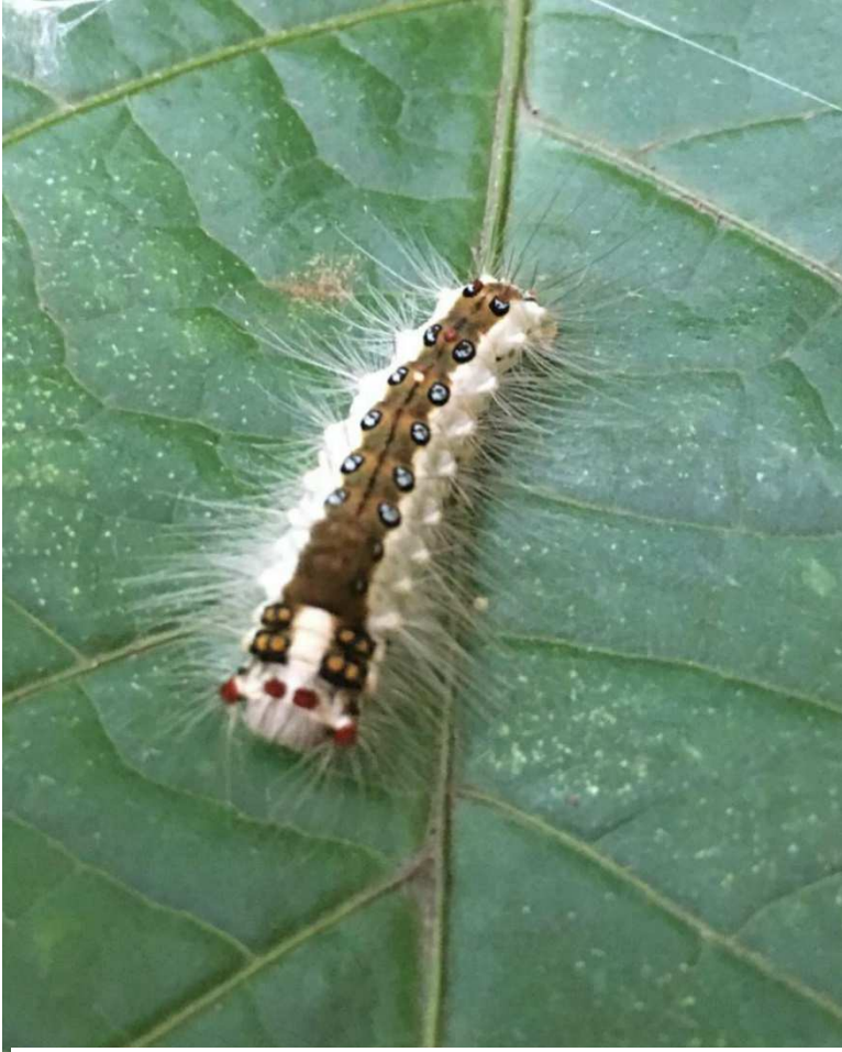
Boomika KV (1BY20CV005 )VI semester